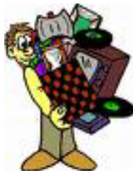
TABLE SPACE STILL AVAILABLE FOR KID'S YARD SALE

For more information or to rent a table, contact the Community Center at 767-7650.